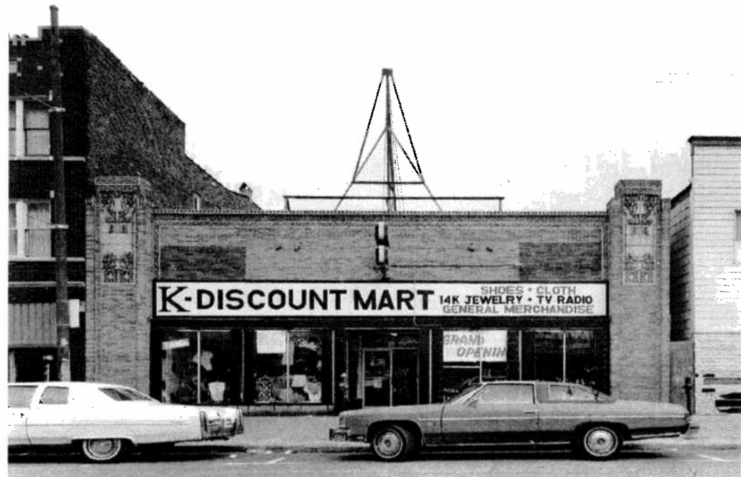
TOP: An excerpt from a Peoples Gas Light and Coke Company newsletter in June 1925, showing the interior and exterior of the building, shortly after its opening as the company's South Chicago neighborhood store.